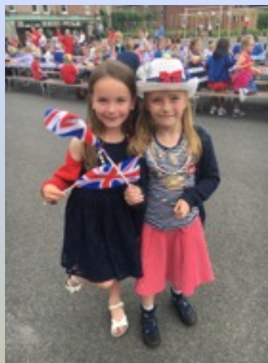
The Queen's Birthday