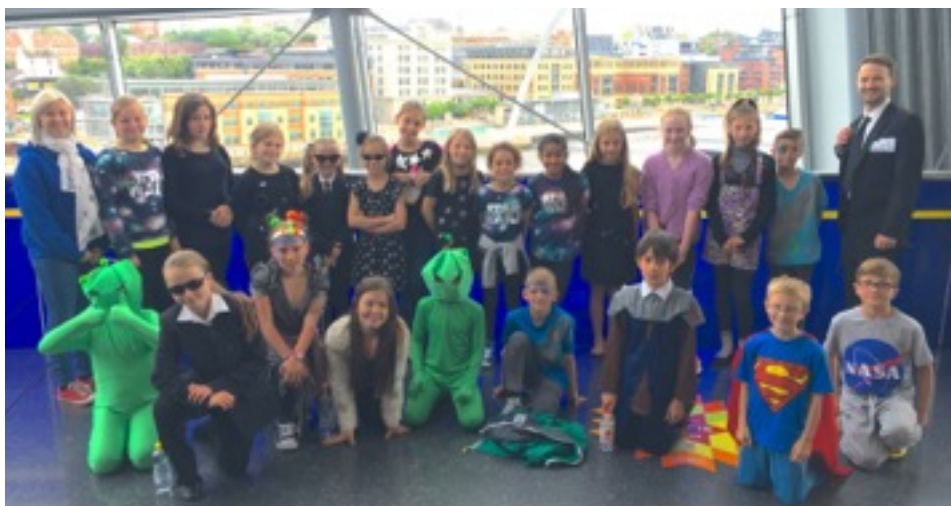
The School Choir at The Sage, Gateshead for a galactic, space-themed Big Sing. Our pupils not only sang brilliantly, they were unquestionably the best dressed!