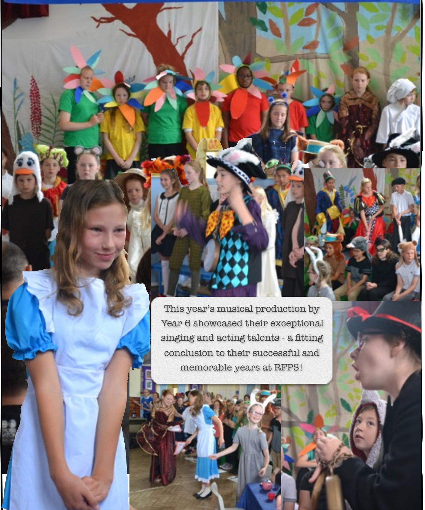
This year's musical production by Year 6 showcased their exceptional singing and acting talents - a fitting conclusion to their successful and memorable years at RFPS!