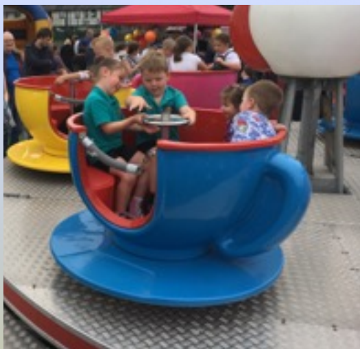
All the Fun of the Fair