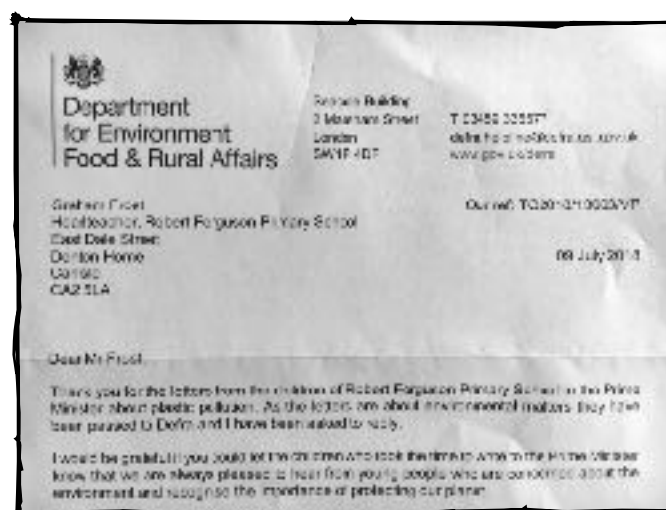
Part of the letter received from The Department for Environment, Food and Rural Affairs.

“We wrote a letter to the Prime Minister to try and help our oceans and protect the sea life. “We were very excited to receive letters back to show that they had listened to our concerns. “We hope to see improvements in the future.”