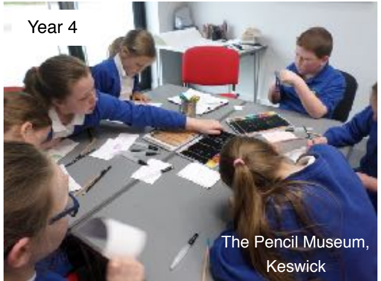
The Pencil Museum, Keswick