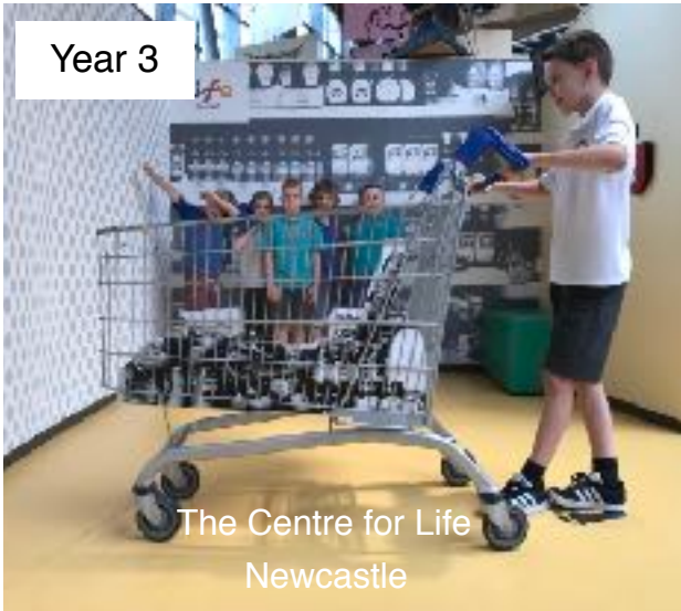
The Centre for Life Newcastle