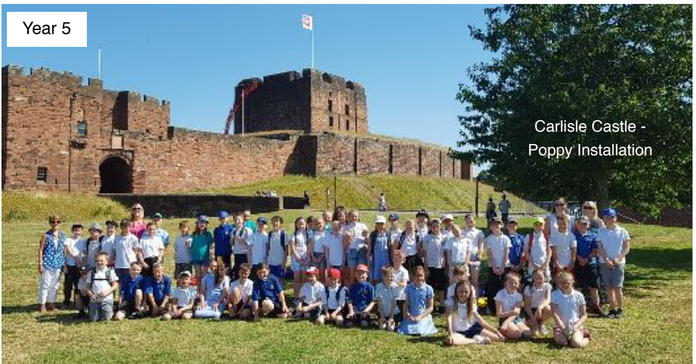
Carlisle Castle - Poppy Installation