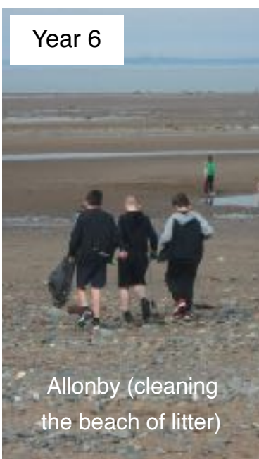
Allonby (cleaning the beach of litter)