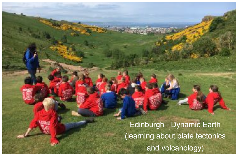
Edinburgh - Dynamic Earth (learning about plate tectonics and volcanology)