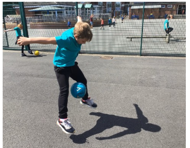
Ash Randall, Football Freestyler visited us to provide inspiration - to have a go at freestyle football, and to think about what we can achieve with determination and practice!