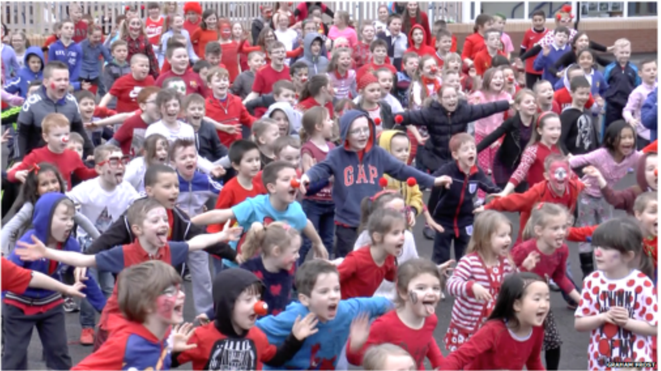
Fundraising events for Red Nose Day 2015 took place across the country. On Friday, pupils from Robert Ferguson Primary School in Denton Holme, Carlisle, performed a dance routine in the playground to Bruno Mars' song, Uptown Funk, to help raise funds for the charity.