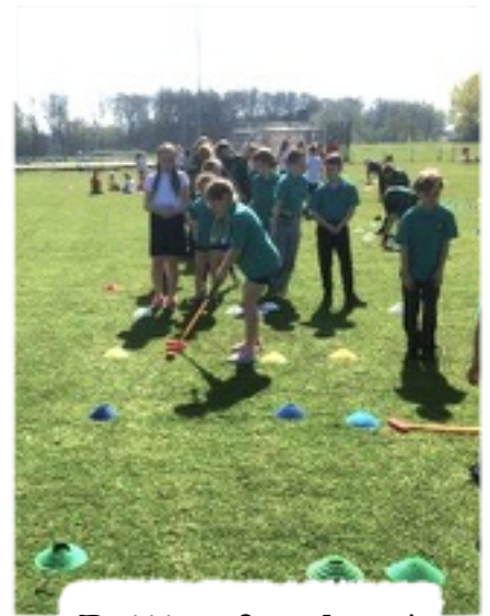
Putting for glory!