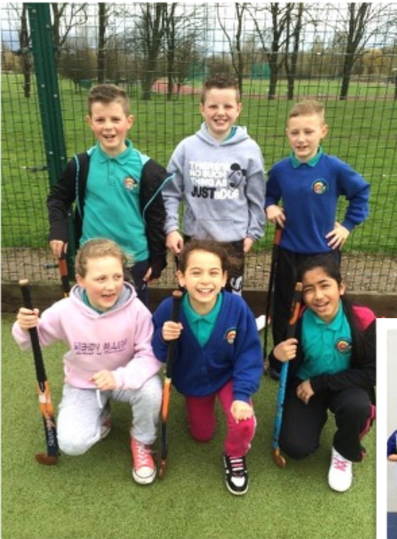
Quickstixing together at the hockey competition.