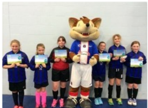
Girls football with CUFC mascot Olga the fox.