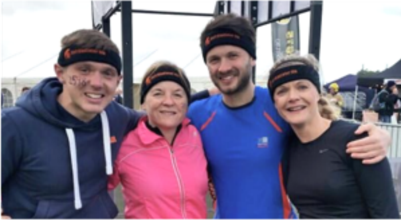
Super teachers conquer Gelt Gladiator