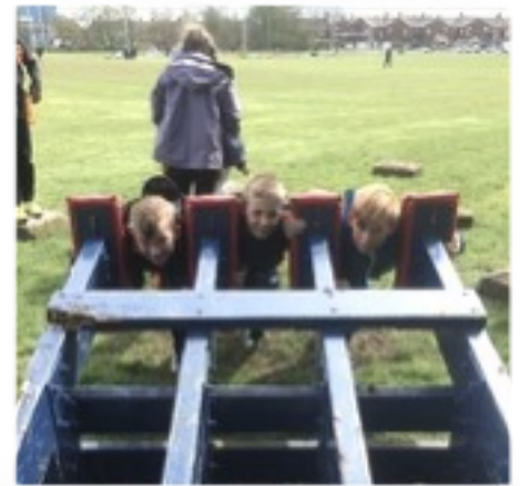
Pushing for victory at the tag rugby competition