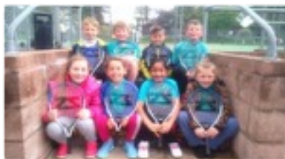
Tennis stars had an ace time!