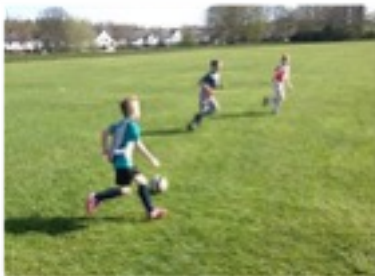
"Square it, I'm unmarked!"