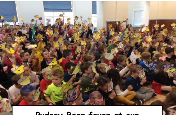
Pudsey Bear fever at our Children in Need assembly!

Well done everybody and thank you for your donations!