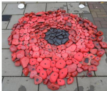
Our poppy sculpture in the reflection garden

Remembrance Day took place on November 11 th . Did you know that the poppies we wear as a symbol of remembrance were inspired by the poem 'In Flanders Fields' by John McCrae? The opening lines refer to the thousands of poppies that were the first flowers to grow in the churned-up earth of soldiers' graves.